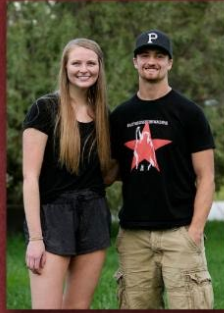
Volleyball & Football