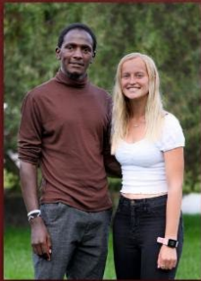
Residence Life Association