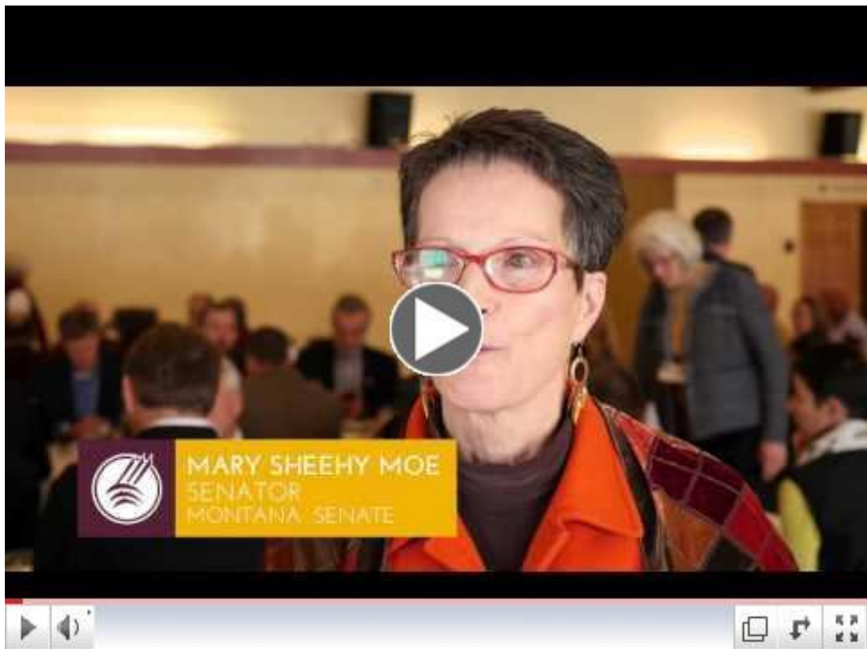
Highlight video of the One MSU Symposium