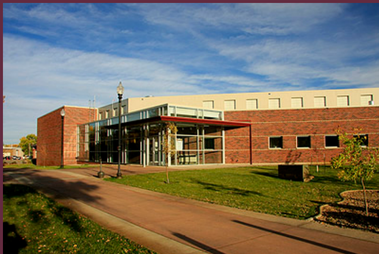
Applied Technology Center